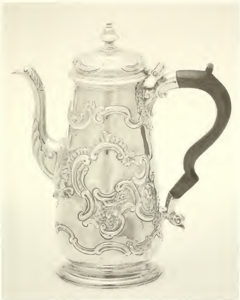
Coffee pot by Alexander Petrie; silver; Charleston, S.C.; 1742–1768. HOA 10 \frac{3}{8} ". MESDA acc. 3996.